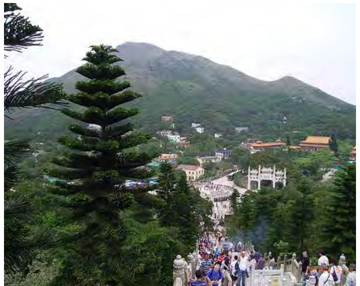
Hong Kong pictures